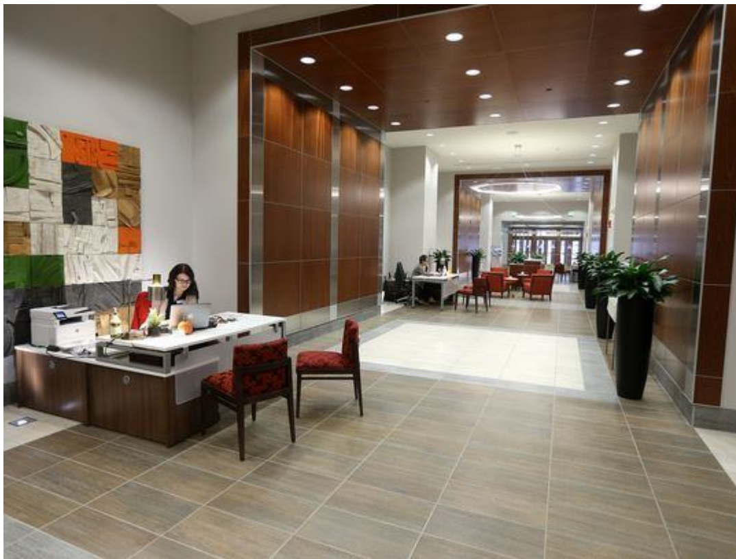
The lobby in Sibley Square is sometimes used as event space.

Smack dab in the middle of downtown, the historic Sibley Building, renamed Sibley Square, is in the midst of a renaissance.