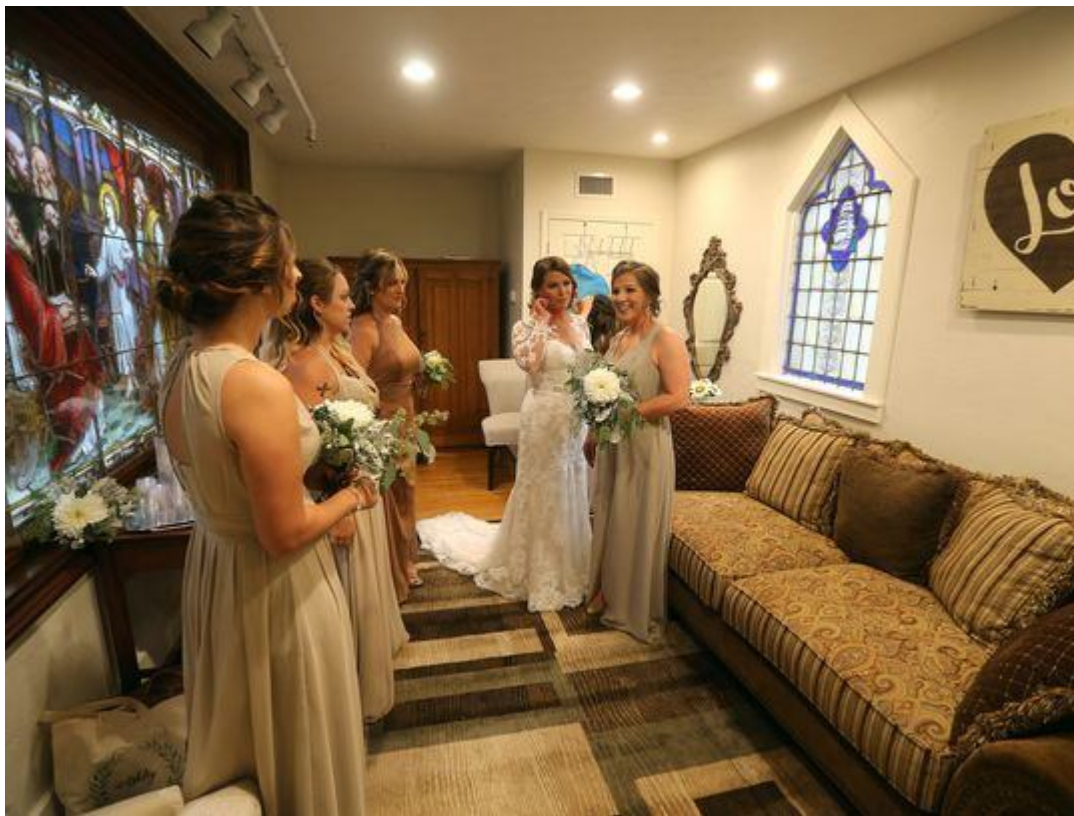
Chapel Hill offers a bridal room where the bridal party can gather before the ceremony.

Read or Share this story: http://on.rocne.ws/2x4kZHe