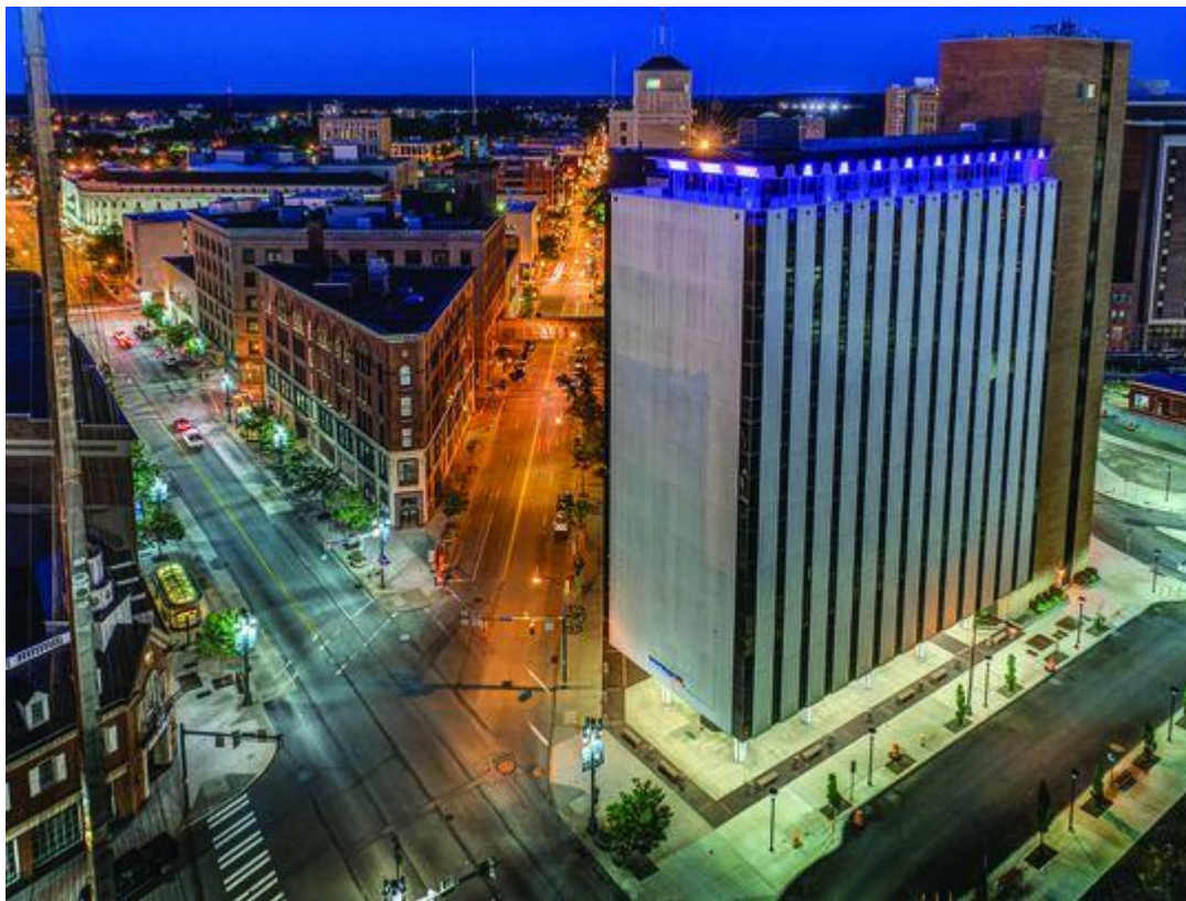
The Penthouse downtown

The Penthouse is a rooftop event venue in the heart of downtown Rochester. Entrepreneur Brittany Brandt saw the need for party venues. Floor-to-ceiling wrap-around windows showcase panoramic views of Lake Ontario and the city.